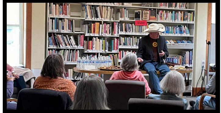
Craig Johnson Author Talk

We applaud our library staff for their dedication to increasing programming for all ages. And we appreciate your donations, which allow us to provide this programming. Our Patagonia Library is a happening place where community members and visitors drift in (and sometimes flock in) all day long, 6 days a week. Thank you for helping us make all this activity happen.